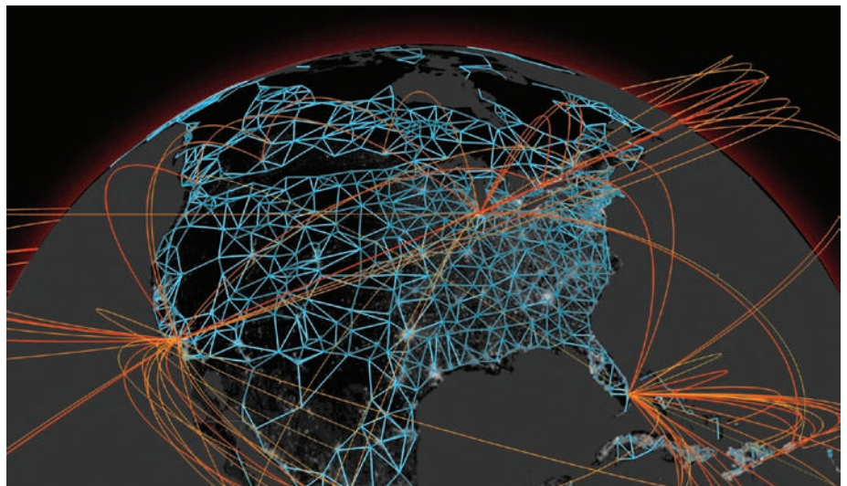
Figure 1 | Interconnected networks of human mobility in North America. The blue network represents short-range commuting flows by car, train and other means of transportation and transport infrastructures. Yellow-to-red lines denote airline flows for a few selected cities; red corresponds to greater traffic intensity. Population density is identified on the grey/white colour scale, with white corresponding to areas of higher density. All features in this map were obtained from real data 10 .

Viewed from this perspective, critical infrastructures are complex systems for which it